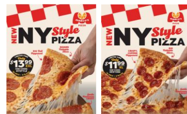
Countertop sign (left-Houston, right-Orlando)