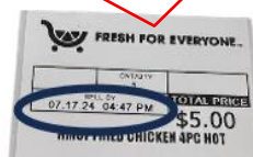
Sell-by time label