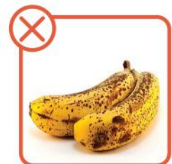
Green or gray, blemished, bruised