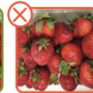
Pale or dark red, blemished, shriveled