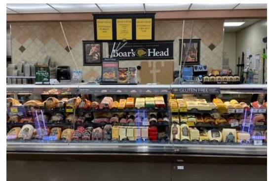
Full-service deli counter