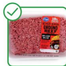
Product is fresh, with a bright red/pink color and intact packaging.