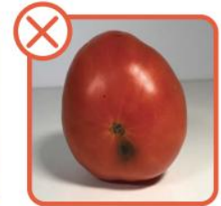
Pale, soft, blemished, dark spots