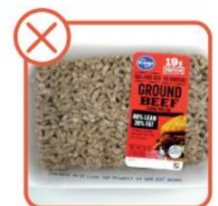
Gray or pale in color, package has excess liquid.