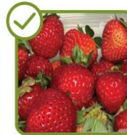
Ripe, bright red, fresh scent