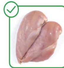
Fresh, not expired, no leaks.