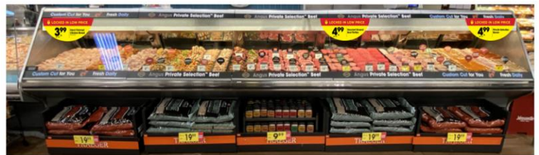
Meat service case at the full-service counter