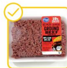
Product may be slightly faded and shows no signs of graying.