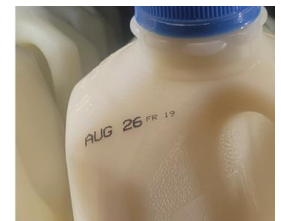
Stamped expiration date