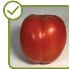
Brightly colored, firm, fresh scent