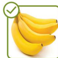
Little green or fully yellow, unblemished, unbruised