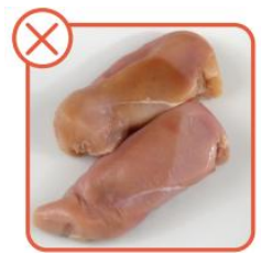
Gray in color, skin looks dry, packaging not intact.

Ground Beef. Evaluate 3 random packages from the self-service cases/shelves.