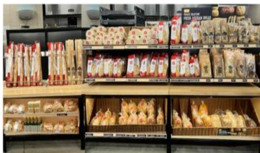
Artisan bread display