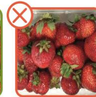
Pale or dark red, blemished, shriveled