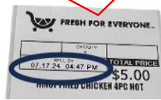
Sell-by time label