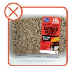
Gray or pale in color, package has excess liquid.