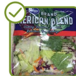
In date, cold, bright colored (no rust)