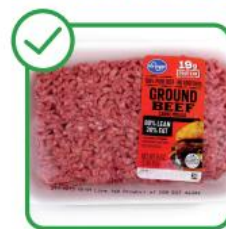
Product is fresh, with a bright red/pink color and intact packaging.