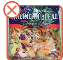
Out of date, discolored (rust colored/brown, wilted, warm)